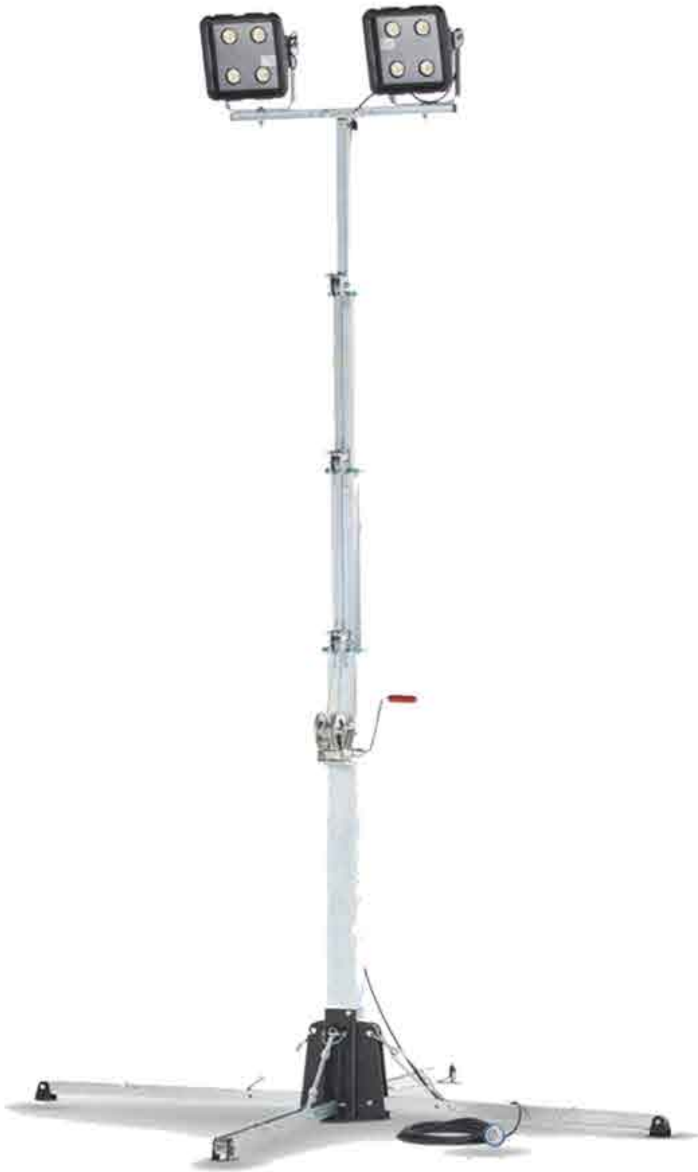
TWLM 4x200W LED