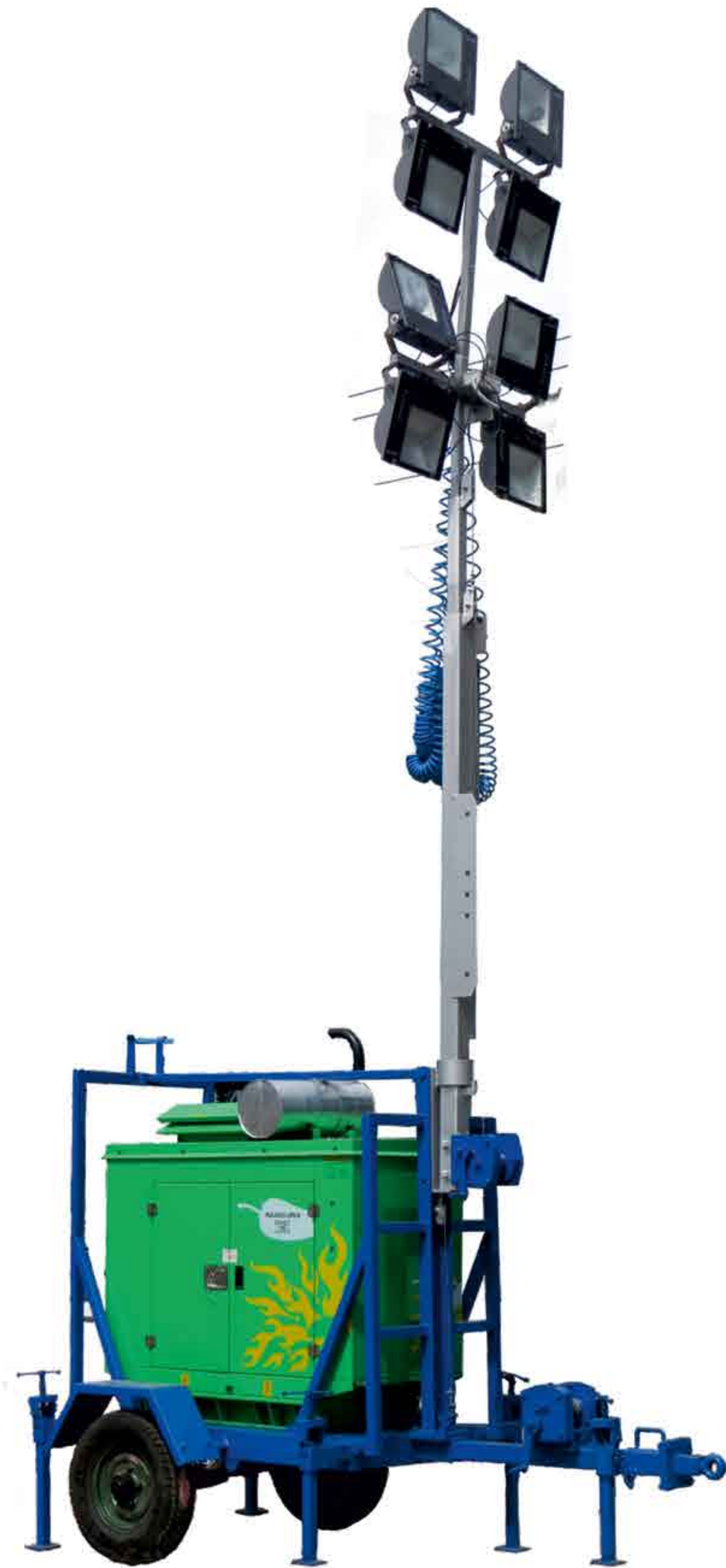
TWB 4x150 W LED