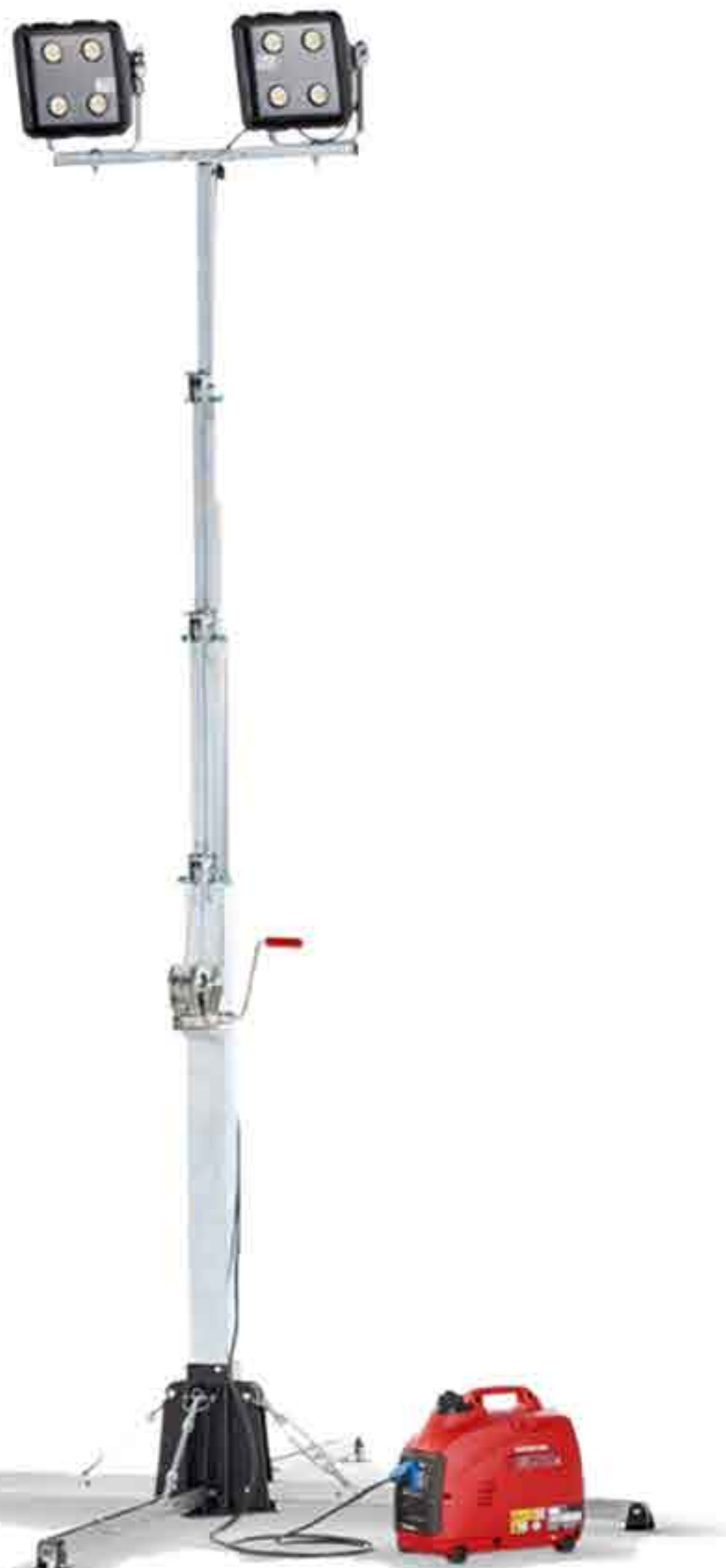
TWLM2 4x65W LED