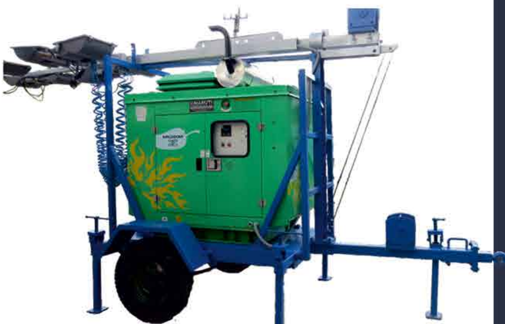
TWDG 6x200 W LED