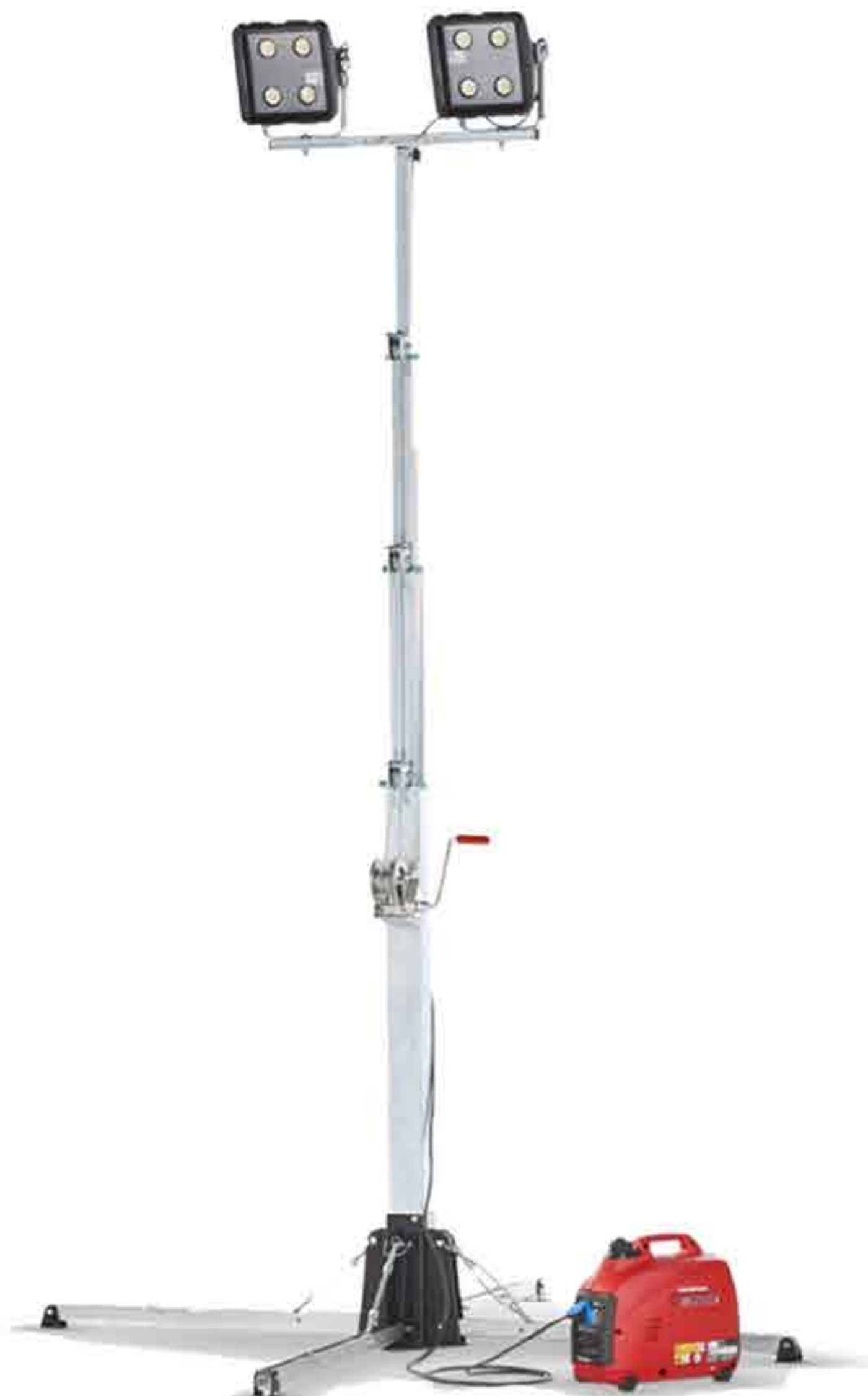
TWLM 4x150W LED