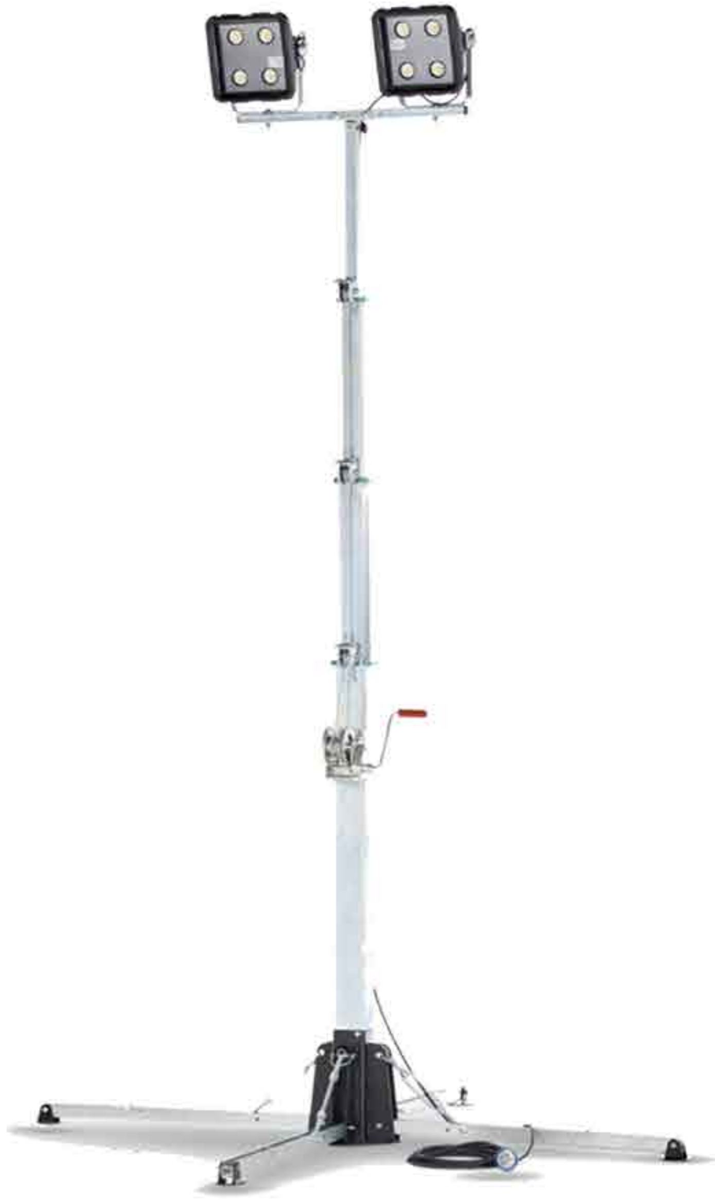
TWLM1 4x65W LED