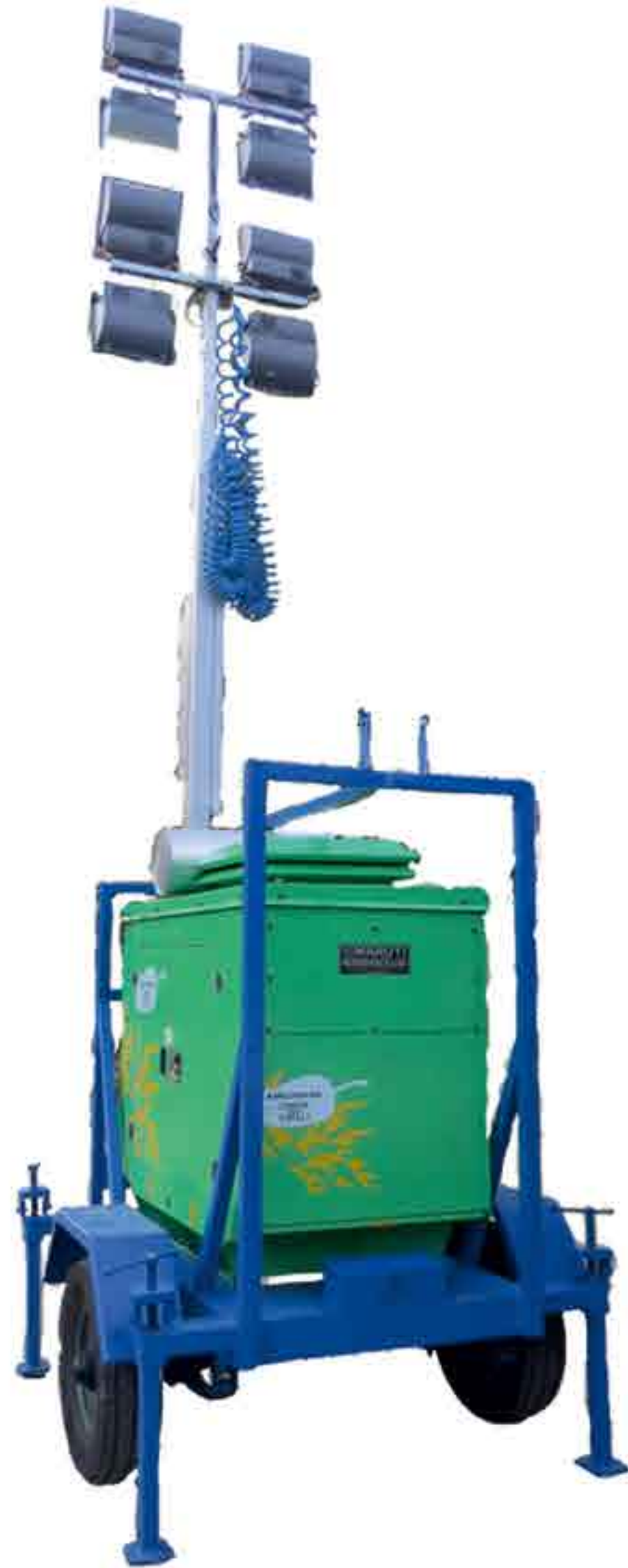
TWDG 4x200 W LED